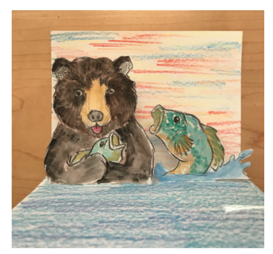
Voila! A finished design. This design is an Alabama food chain with a black bear and big-mouthed bass. The card is folded to show the sky on top and water on the bottom.