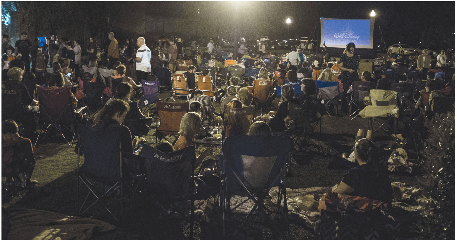
Top: The crowd at October's Art After Hours